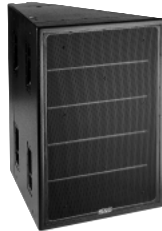
Prototype shown with temporary hardware